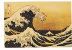
Fine gold card Japan