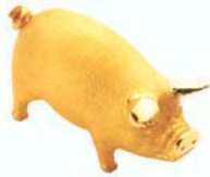
Model bar South Korea