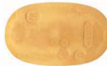
Koban bar Japan