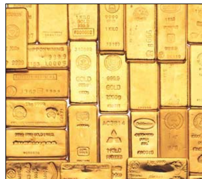
The Industry Collection is the world's largest collection of gold bars.

The Industry Collection, originally stored in the vaults of N M Rothschild & Sons (Singapore) Limited, was relocated to The Perth Mint in 2003.