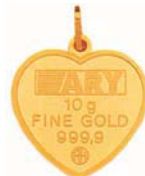
Heart bar Dubai