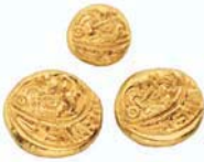
Tezabi bars Pakistan