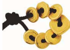
Doughnut bars Hong Kong