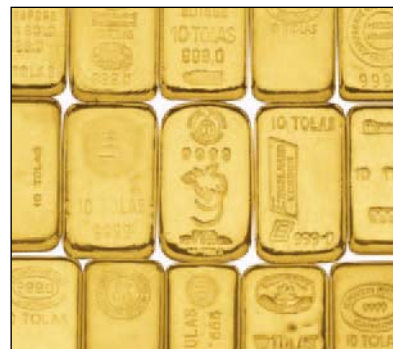
Small 10 tola bars (3.75 oz) were imported unofficially into India for more than 50 years.

For Exhibition purposes, the collection also includes examples of gold-bearing ore, nuggets, bullion coins and bar manufacturing equipment, as well as jewellery and industrial items that illustrate the end uses of gold.