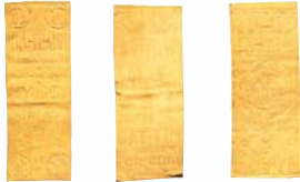
Gold leaf bars Vietnam

Illustrations of some unusual categories within the Industry Collection