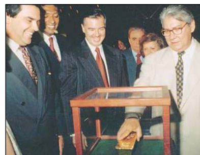
Exhibitions of the Industry Collection capitalise on man's fascination for gold.