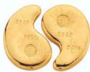
Yin-Yang bars Japan