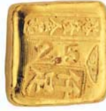
Button bar Thailand