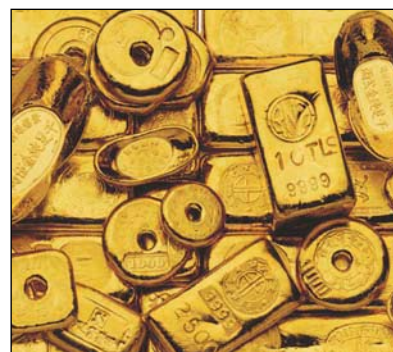
Unusual biscuit, boat and doughnut bars from Hong Kong.