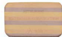
Rainbow bar Japan