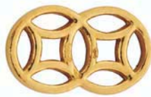
Twin-coin bar Thailand