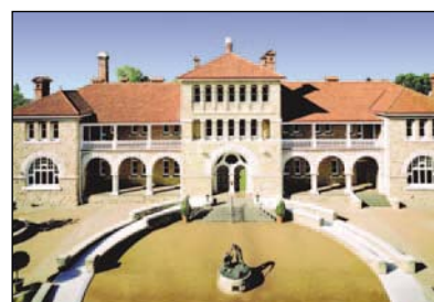
The Perth Mint is the custodian of the Industry Collection.